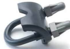
Right Angle Beam Clamp