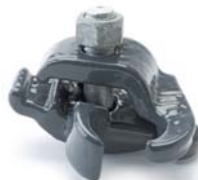
Edge Beam Clamp