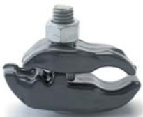
Parallel Beam Clamp